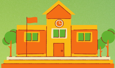
Hildreth Elementary School

Education & Demonstrations at the Hildreth Elementary School Hub: