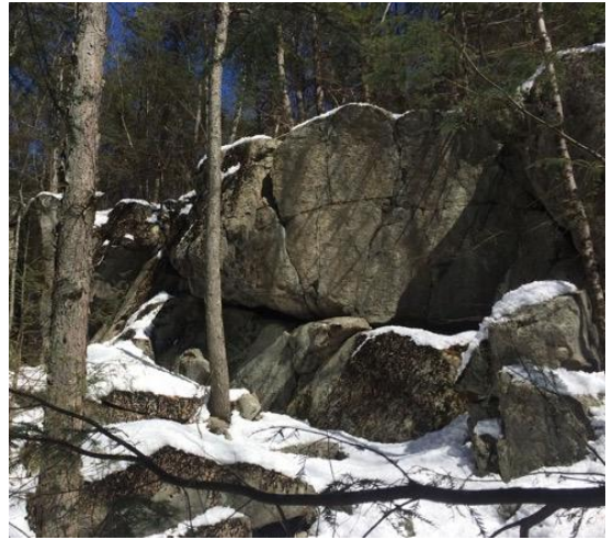
Cliffs on the Kaufmann Property

From our start, the full route includes three properties. We begin with a loop on the Harvard Conservation Trust's scenic Ohlin Property down to the banks of Bowers Brook. We next swing through Harvard's Town Forest and then cross over Rt. 2 on Poor Farm Road to traverse the Kaufmann land, taking in its striking cliffs. Finally, for the energetic, there's an additional extension following the Kaufmann Trail to South Shaker Rd (dotted line on the map), and back.