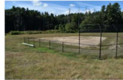
Ann Lees-Jordan - September, 2019