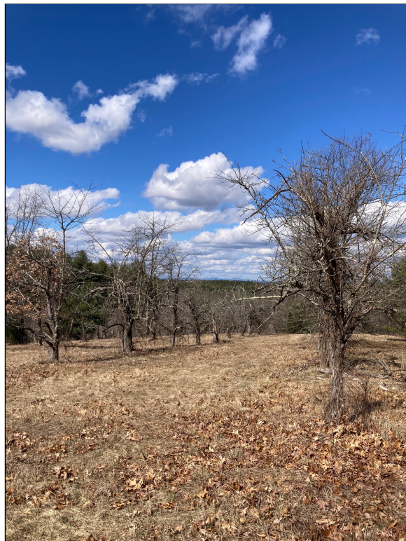
View north from orchard hilltop

A conservation restriction with a public trail on private land allows new access from Crufts Lane. (Hikers only and no dogs allowed.) We will hike 1.5 miles at a moderate pace for about 2 hours; some steep sections. Drizzle ok; rain cancels. For more information contact mwsisson4@gmail.com .