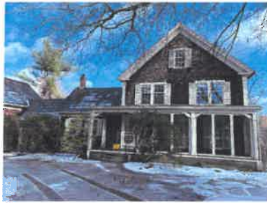
WEST FACING (8)