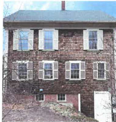
SOUTH FACING (7)