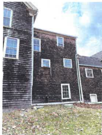
EAST FACING (5)