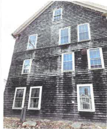
EAST FACING (7)