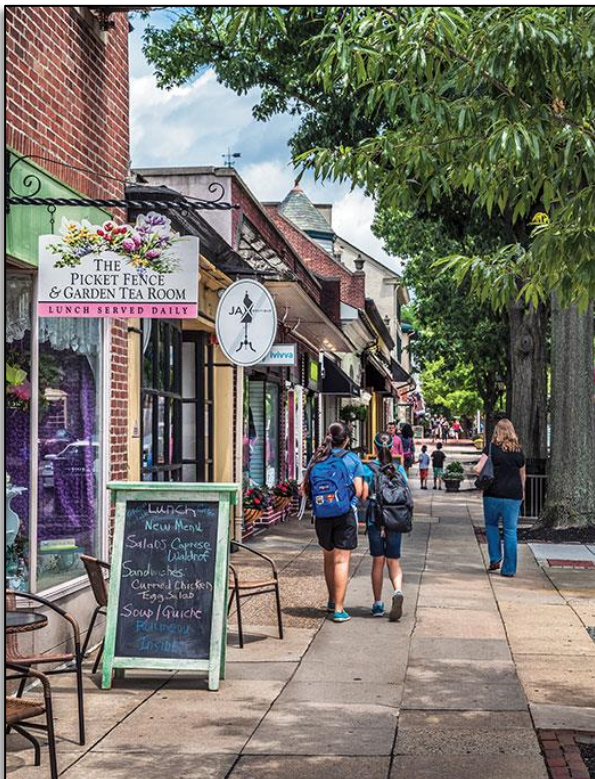
Pedestrian Scale Design