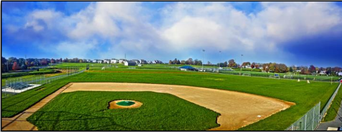
Athletic Fields for Youth Sports