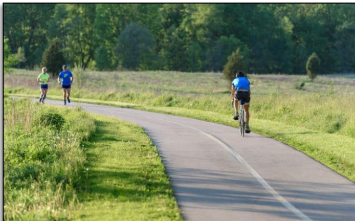
Multi-Use Paths and Trails