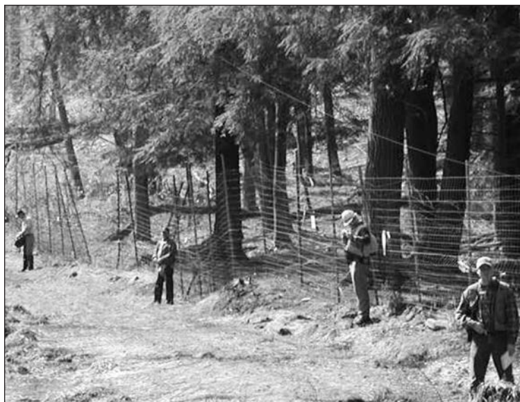
Figure 1. Line-up of counters along fence line prior to deer drive on the small landscape.

claimed. Lands within the small and large landscapes represented a mix of age classes of northern hardwood forest. These forests typically are dominated by shade-tolerant tree species, such as American beech ( Fagus grandifolia ), sugar maple ( Acer saccharum ), and eastern hemlock ( Tsuga canadensis ). The forests are characterized by an uneven age structure, with major disturbance factors being windthrow and ice storms, and are managed for sustainable production of timber by even-aged forest management techniques.