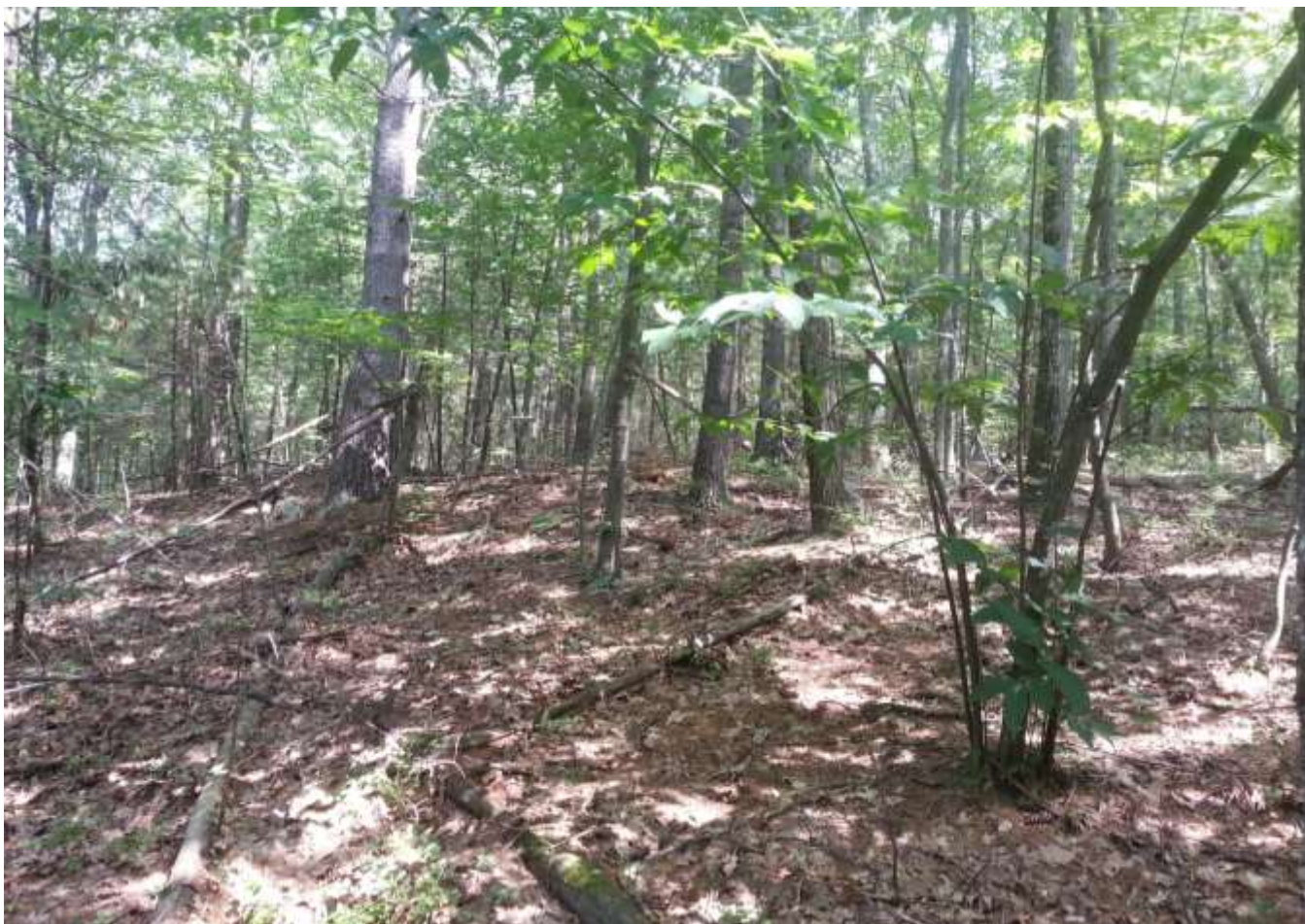
Overall look of the forest showed a sparse herbaceous layer at Pin Hill.