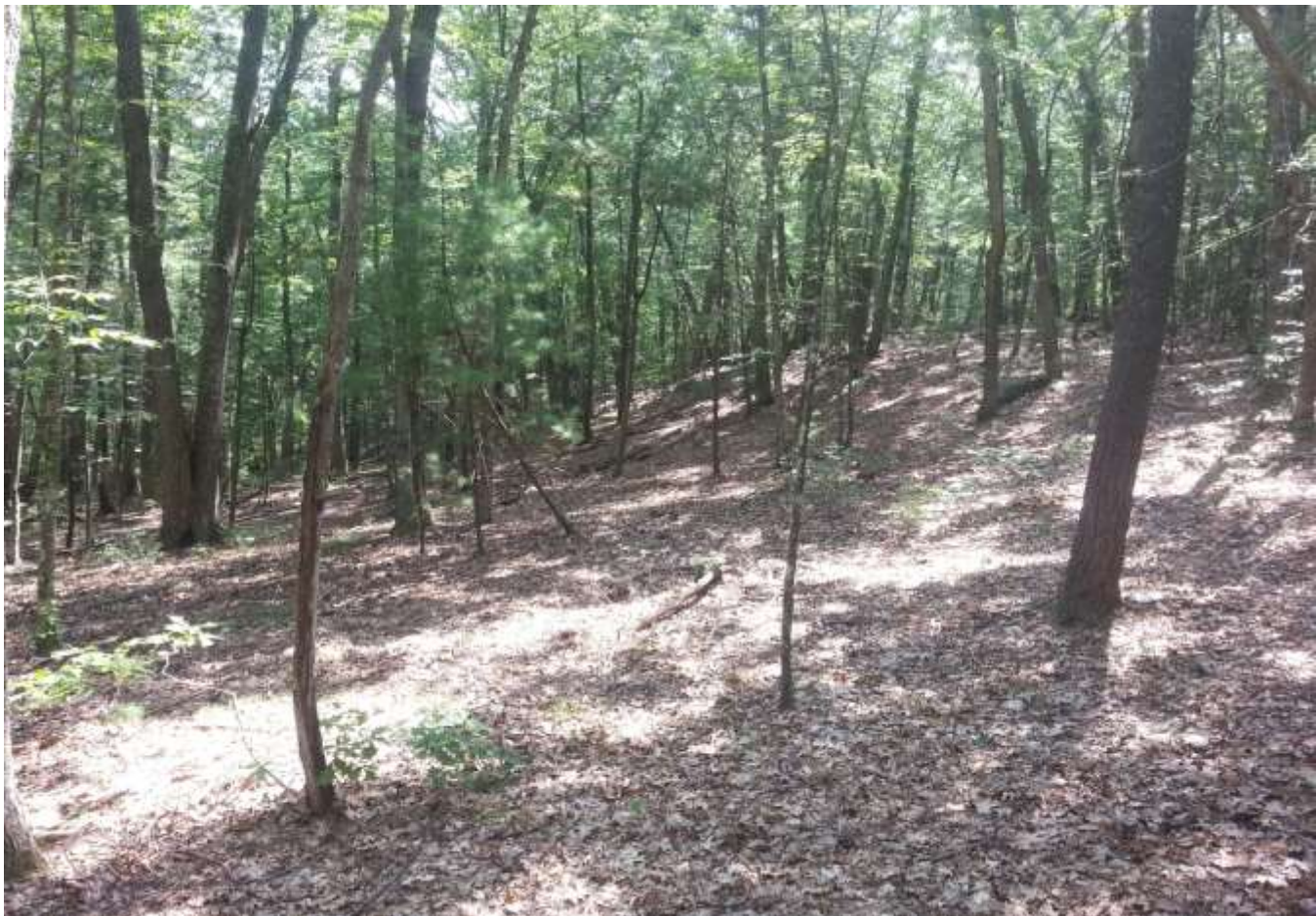
Overall look of the forest near the Tully land with a quite bare understory.