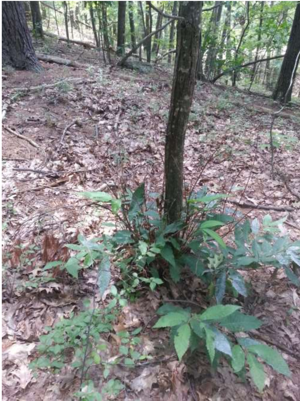
Browsing on American Chestnut suckers. Sparse herbaceous layer can also be seen. Pin Hill