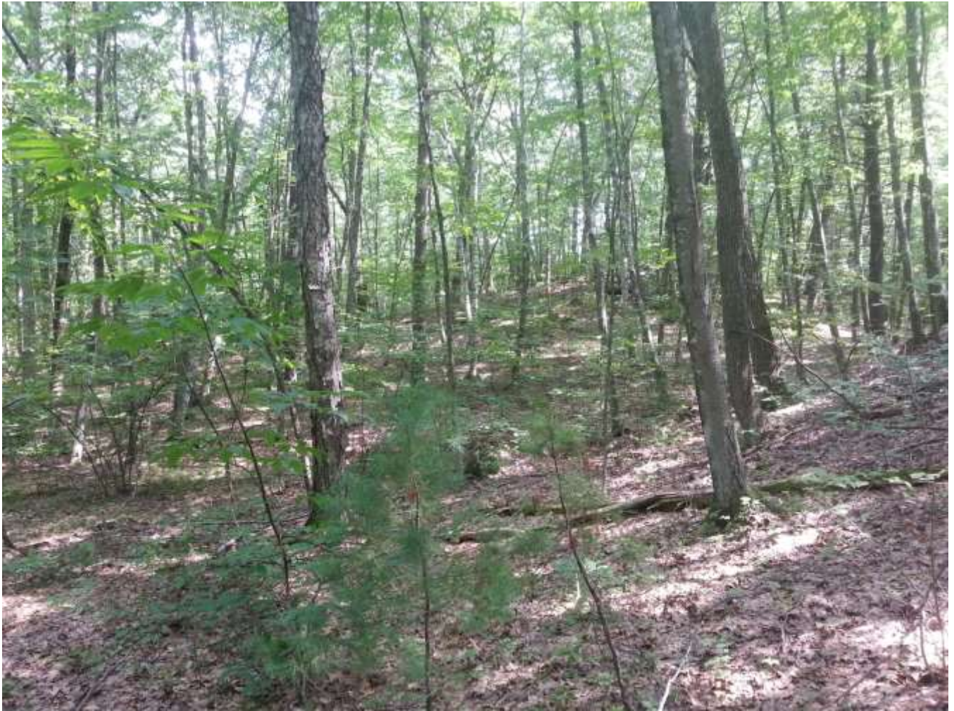
View on the Tully land, where from afar looked like a healthy and diverse understory, but was actually dominated by white pine and witch-hazel, which deer don't prefer.