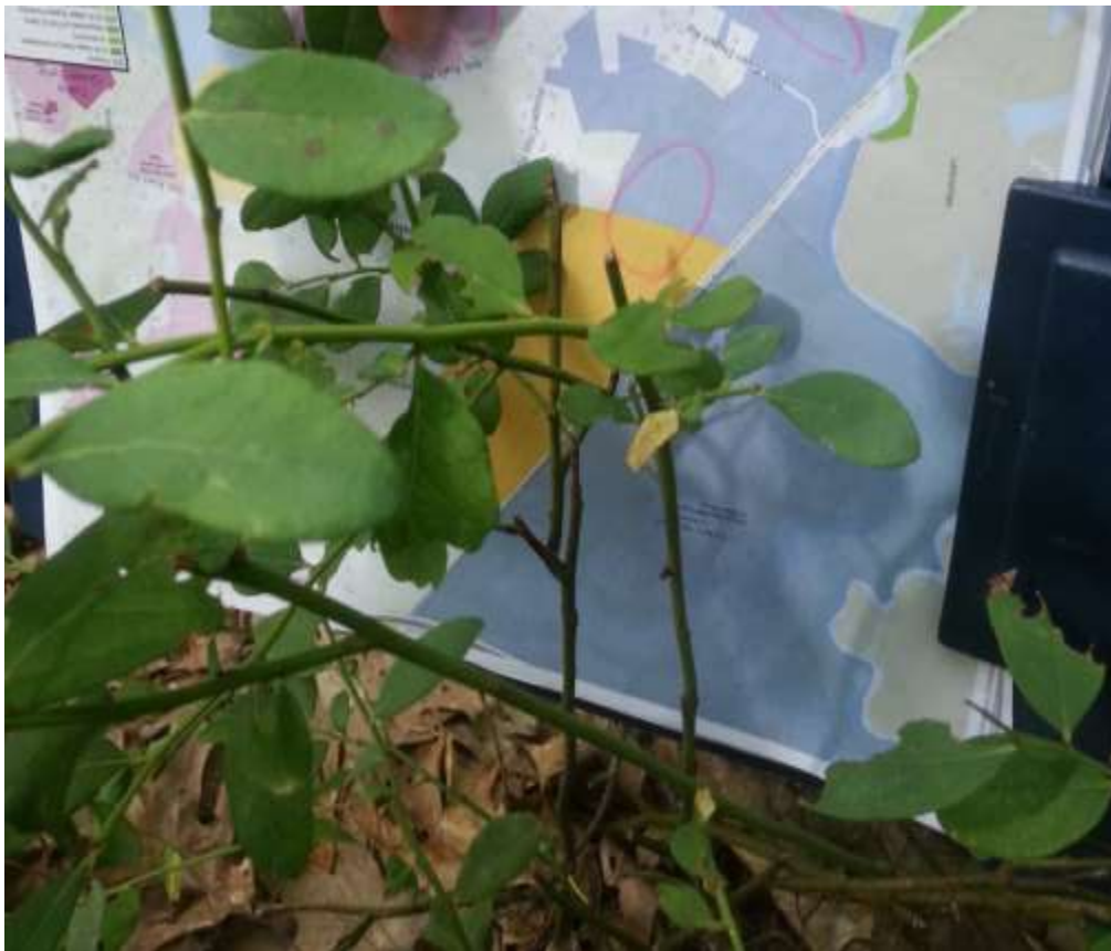
Browsing on low-bush blueberry at Pin Hill, typically not preferred by deer.